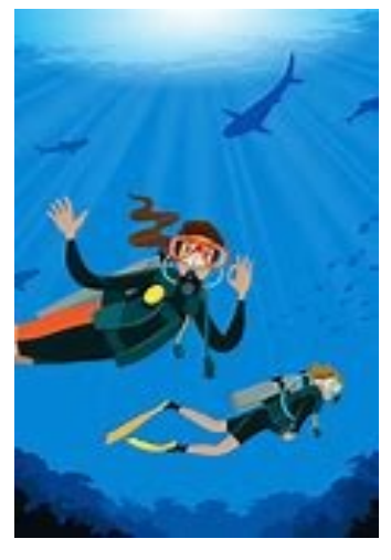
Michigan is among the top 10 places in the united States to scuba dive in freshwater!

The first slide was invented in 1922 and was made out of wood! It was claimed to be VERY uncomfortable!